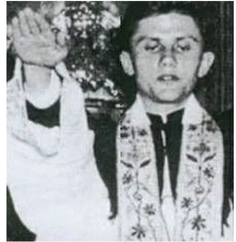
Pope Benedict XVI (young Ratzinger) saluting Hitler as a youth.