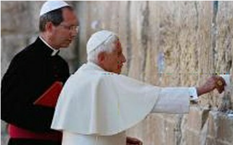
Pope Benedict XVI places his note to God in the Western Wall at Judaism's holiest site in Jerusalem's Old City, Israel.

The muddle overshadowed the second day of the Pope's visit to Israel and the occupied Palestinian territories, when he visited sacred sites around Jerusalem and sought to bridge the historic divide between Catholicism and Judaism.